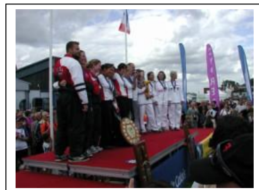
Prize-Giving - Maubeuge 2009

Two official ceremonies are to be held during the event; an opening and a closing ceremony. Both official ceremonies should involve the athletes and be attractive to the public. A protocol guide is available from the FAI.