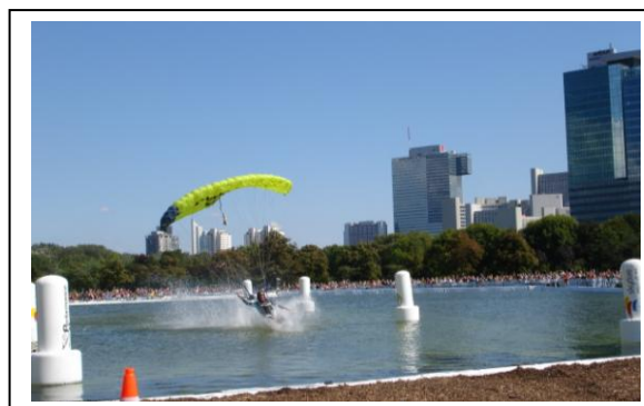
Canopy Piloting World Championships - Vienna 2007

For all disciplines except Canopy Piloting, there must be a flat, grass landing zone of some 100 x 150 meters, clear of obstacles and spectators. For Canopy Piloting events, the landing zone must be at least 100 meters wide and 270 meters long and start with a pond or other suitable body of water (minimum: 65 meters long x 15 meters wide x 60cms deep), followed by a flat area (the exact course requirements are available in the competition rules).