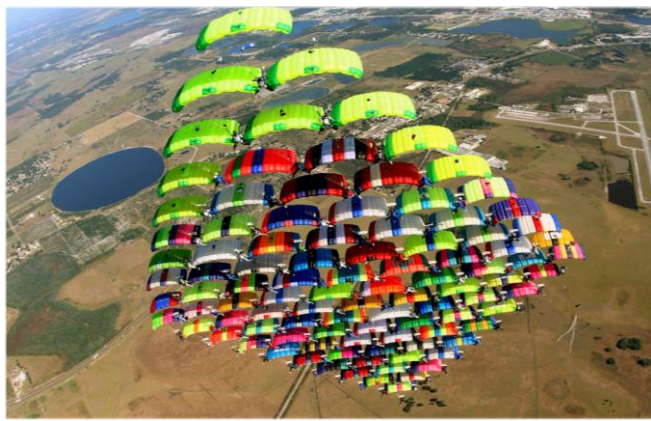
World Record CF - 2008