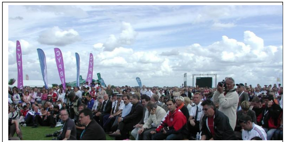
Crowds at World Championship - Maubeuge 2009